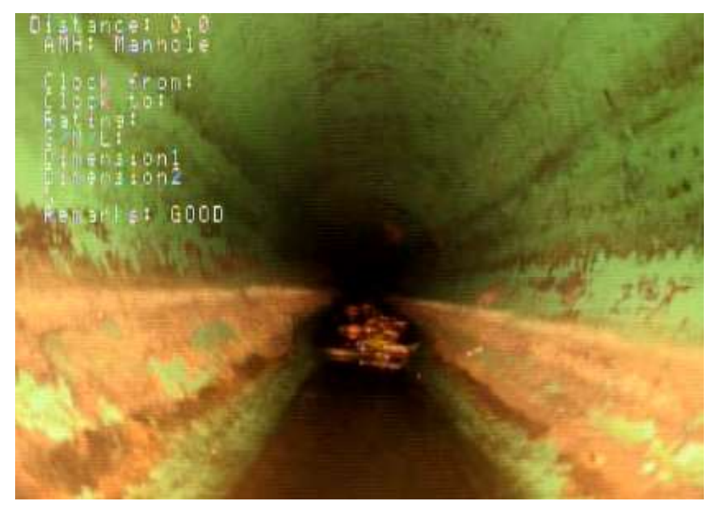
Interior of sanitary sewer pipe serving Vehicle Maintenance Building