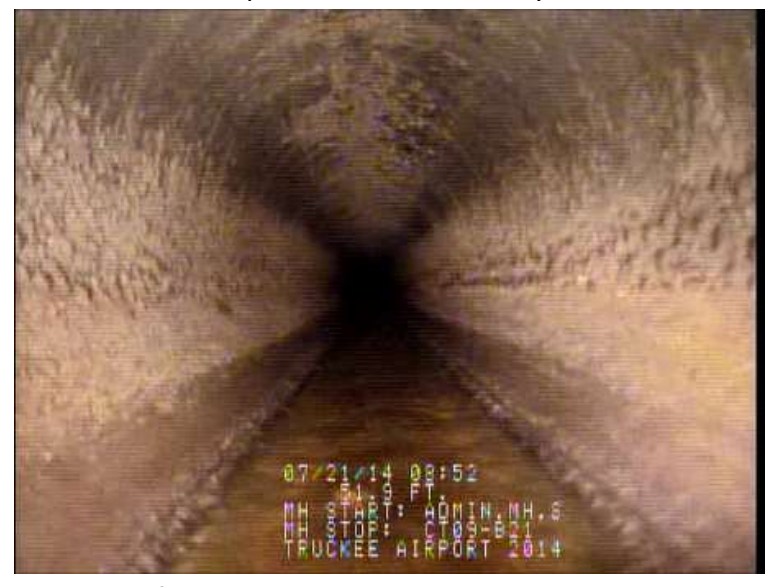
Interior of sanitary sewer pipe serving Administration Building