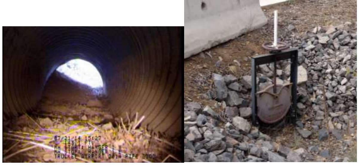
Storm Drain Pipe and Slide Gate

Description: The airport's storm drain collection system consists of slightly less than 10,000 lineal feet of 12 through 24-inch diameter pipelines, the majority of which is Corrugated Metal Pipe (CMP) with limited amounts of High Density Polyethylene (HDPE) and Reinforced Concrete (RCP). Other components include 44 drainage inlets, slotted drains between Hangar Buildings: A/Jet Ramp, B/C, C/D, D/E, E/F and G/H, along the south side of the ramp in the vicinity of Hangar 2 and the Administration Building and on the south and west sides of the warehouse, two slide gates that are closed when the self-serve island is filled (to contain a fuel spill) and two 500-gallon overflow containment structures at the fuel farm. The previously described video inspection of a portion of the system showed the pipelines were in good structural condition with no apparent corrosion or structural issues however most were at least partially filled with debris. The collection system discharges to basins/swales located on undeveloped portions of the airport property (generally at the end of each runway) where the runoff infiltrates into the ground. This discharge is allowed through an Industrial Stormwater Discharge Permit issued by the Lahontan Regional Water Quality Control Board; District staff submits monthly wet-weather and quarterly dry-weather reports to the Board.