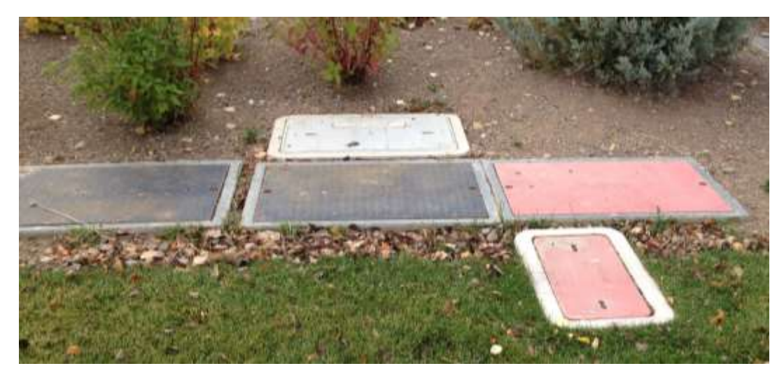
Communication and Power Pull-Boxes

Suggested Communication System Improvements and Maintenance: