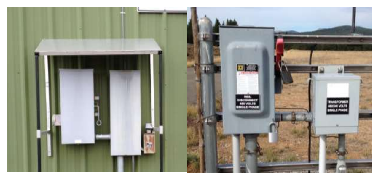
Power Distribution Panels

Suggested Power System Improvements and Maintenance: