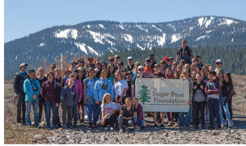
Each year local students work with the Sugar Pine Foundation to plant trees in Waddle Ranch.

cattered across Waddle Ranch are clues to what Martis Valley's forests once were. Old-growth Sugar Pines that escaped the hungry axes of 1870s loggers cluster in hidden stands. Stately Ponderosa Pines stretch to the sky.