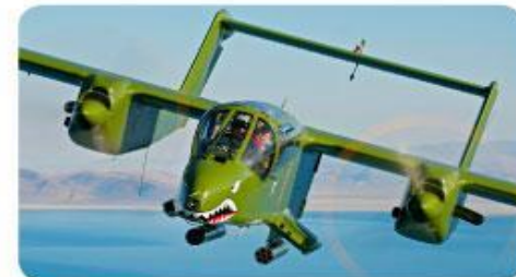
▲ An OV-10 Bronco in flight.

For a current line-up of performers, information on how to get involved in the Veterans Parade, or to find out how to be a sponsor or vendor, please visit www.TruckeeTahoeAirShow.com .