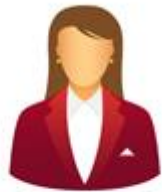
Fresh Tracks PR