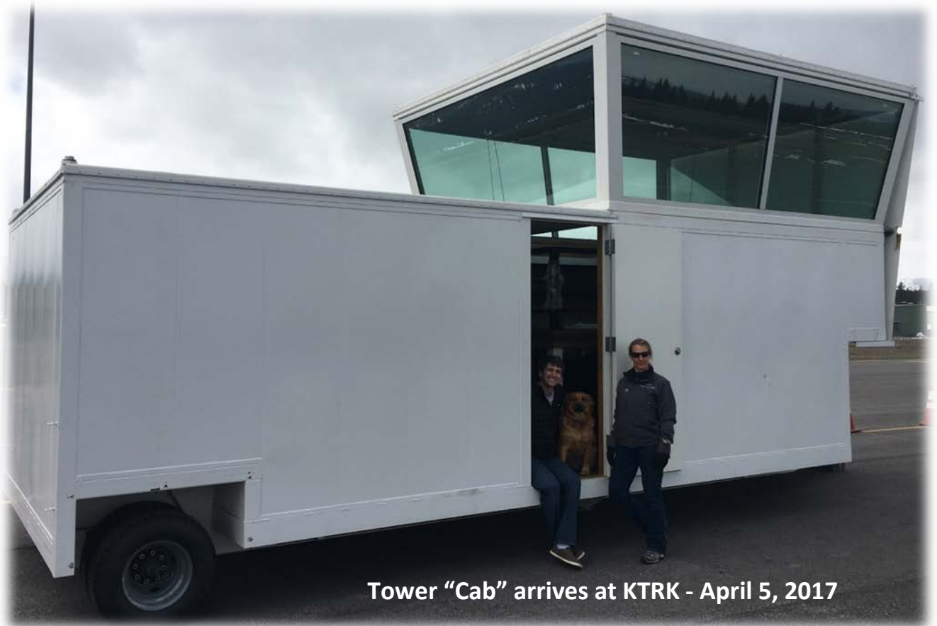
Tower "Cab" arrives at KTRK - April 5, 2017