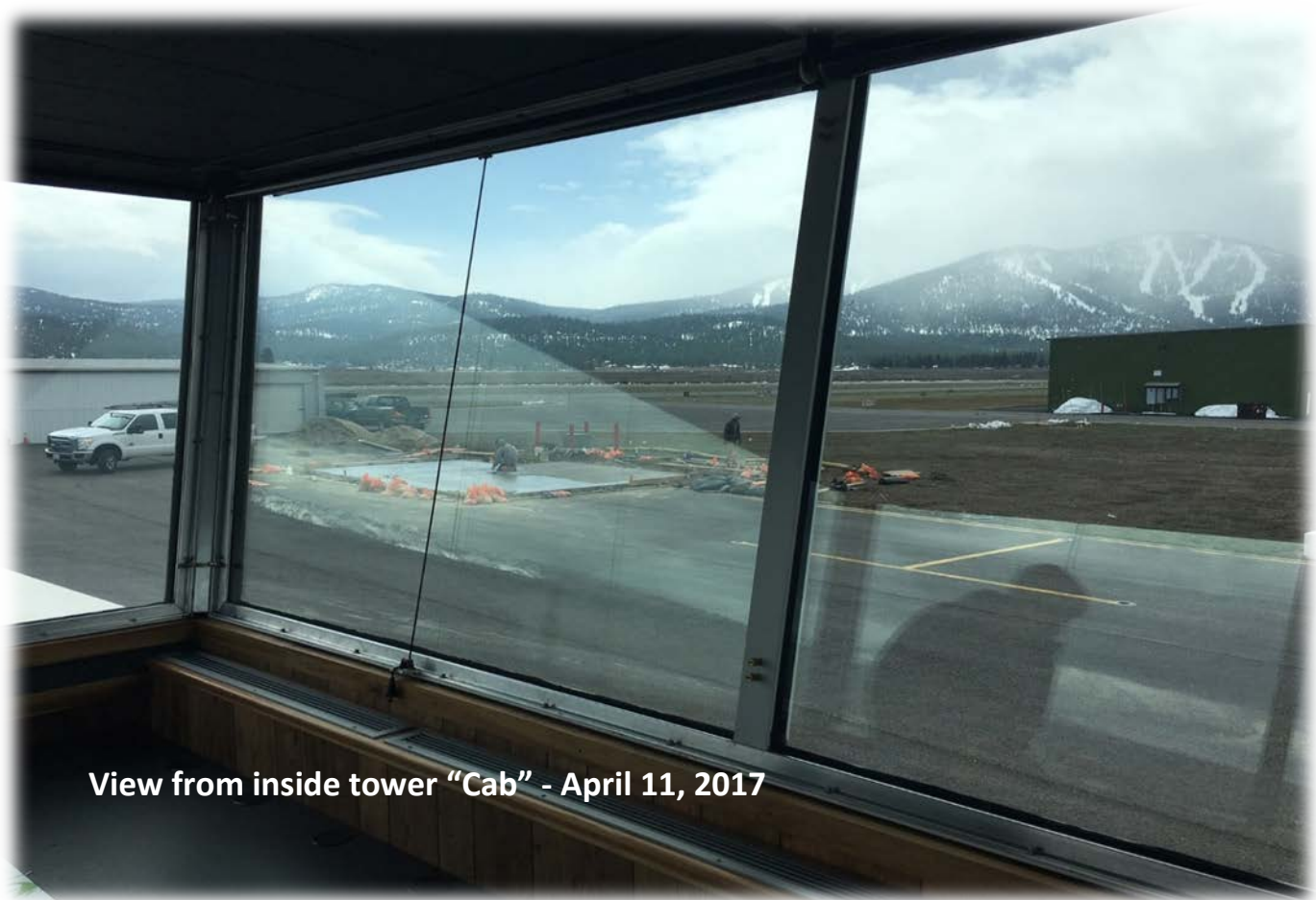
View from inside tower "Cab" - April 11, 2017