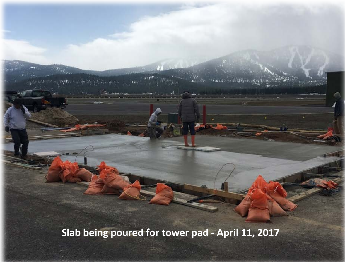
Slab being poured for tower pad - April 11, 2017