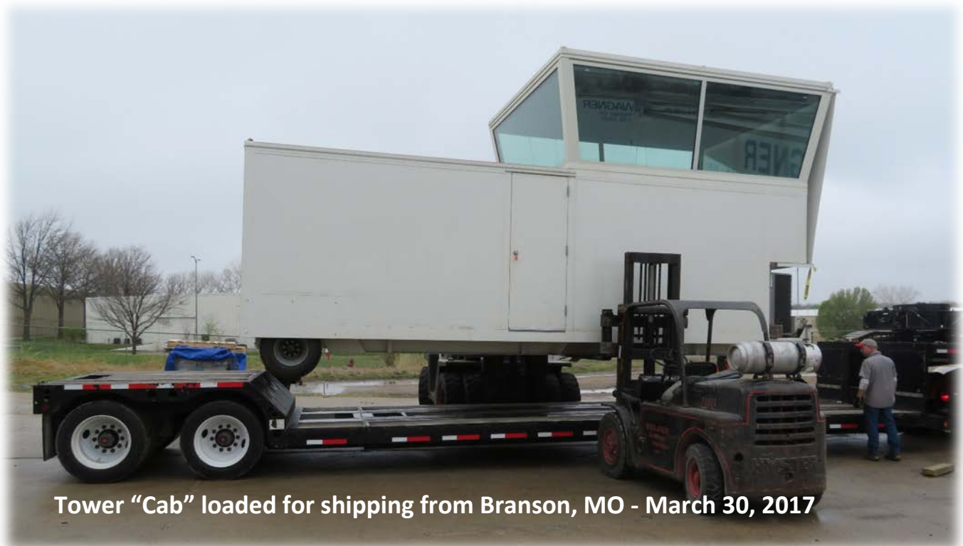
Tower "Cab" loaded for shipping from Branson, MO - March 30, 2017