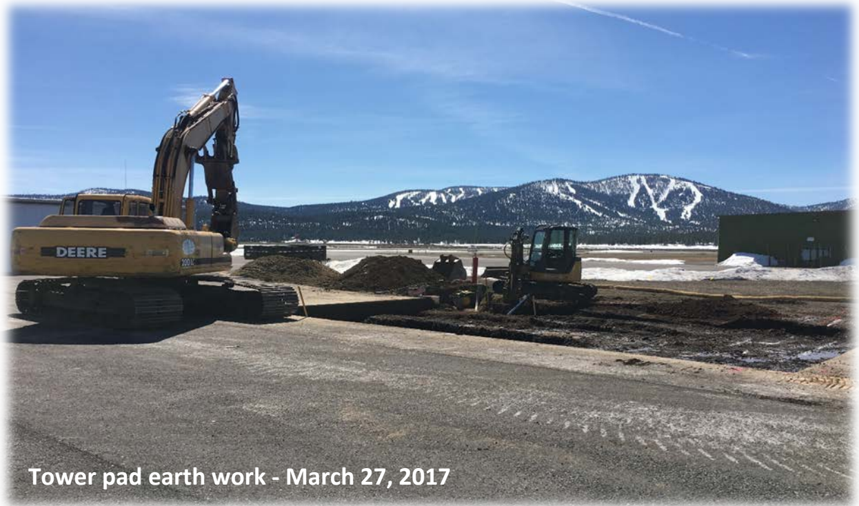
Tower pad earth work - March 27, 2017