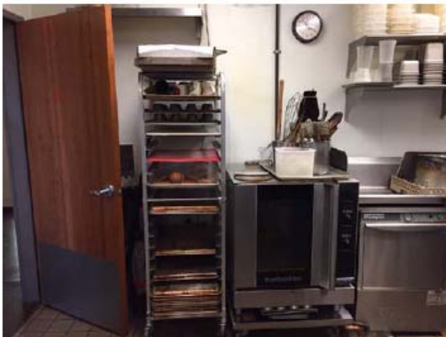
Restaurant Red Truck