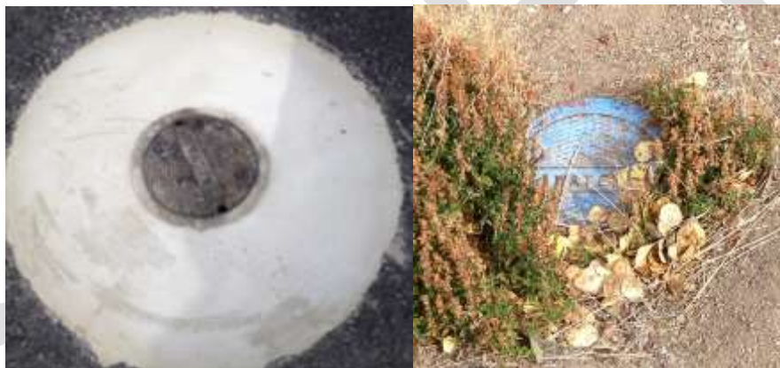
Water System Valves

airport's system is comprised of approximately 10,000-feet of four to 12- inch diameter pipelines made of a variety of materials; the newer (1980's-current) pipes are Polyvinyl Chloride (PVC) while the older (1960's-early 1980's) are Asbestos-Cement (AC). There are 18 fire hydrants and four buildings have fire sprinkler systems (Administration, Vehicle Maintenance and Hangars L&M). The distribution system contains 20 in-line valves (not including those specifically for buildings or hydrants) that can be used to isolate individual sections of network. The expected service life of these pipelines, valves and hydrants is 60-80 years assuming reasonable initial construction methods, consistent pressure and regular maintenance/exercising (hydrants and valves). Domestic water is supplied to nine buildings (Administration, Vehicle Maintenance, Warehouse, Hangar 1, Hangar 2, EAA, Car Rental, Careflight Modular and Hangar M). Recent exploratory potholing at Hangars 1 and 2 indicated that the 50 +/- year old copper and galvanized lateral materials used to supply water to those buildings (and EAA) are likely near the end of their useful life. The glider port is served by an on-site well that was drilled and is operated/maintained by the concessionaire.