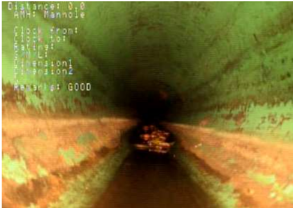
Interior of sanitary sewer pipe serving Vehicle Maintenance Building