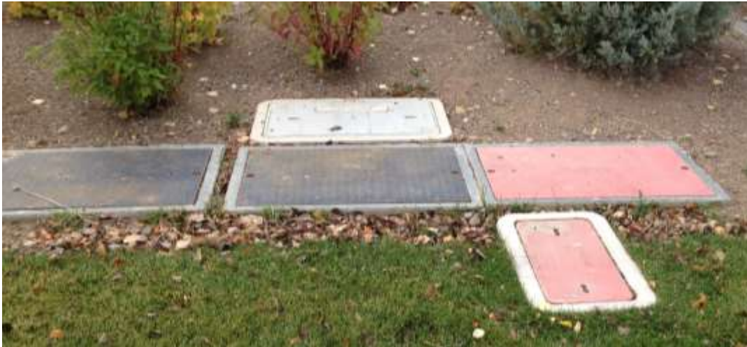
Communication and Power Pull-Boxes