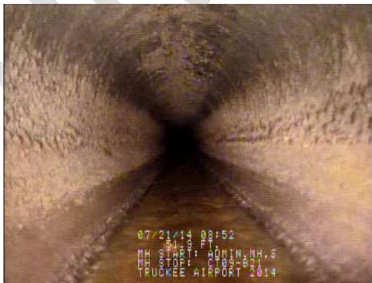
Interior of sanitary sewer pipe serving Administration Building