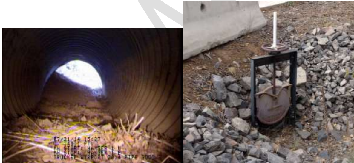
Storm Drain Pipe and Slide Gate

Description: The airport's storm drain collection system consists of slightly less than 10,000 lineal feet of 12 through 24-inch diameter pipelines, the majority of which is Corrugated Metal Pipe (CMP) with limited amounts of High Density Polyethylene (HDPE) and Reinforced Concrete (RCP). Other components include 44 drainage inlets, slotted drains between Hangar Buildings: A/Jet Ramp, B/C, C/D, D/E, E/F and G/H, along the south side of the ramp in the vicinity of Hangar 2 and the Administration Building and on the south and west sides of the warehouse, two slide gates that are closed when the self-serve island is filled (to contain a fuel spill) and two 500-gallon overflow containment structures at the fuel farm. The previously described video inspection of a portion of the system showed the pipelines were in good structural condition with no apparent corrosion or structural issues however most were at least partially filled with debris. The collection system discharges to basins/swales located on undeveloped portions of the airport property (generally at the end of each runway) where the runoff infiltrates into the ground. This discharge is allowed through an Industrial Stormwater Discharge Permit issued by the Lahontan Regional Water Quality Control Board; District staff submits monthly wet-weather and quarterly dry-weather reports to the Board.