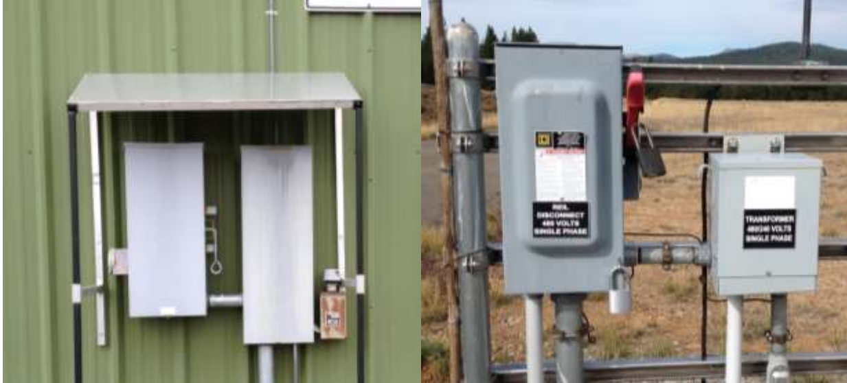
Power Distribution Panels