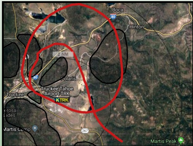
Gulfstream 4 Arrival - April 7, 2019