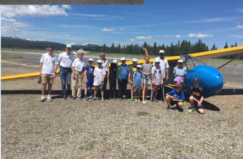
TRUCKEE TAHOE AIRPORT DISTRICT | CONNECTED BY MORE THAN A RUNWAY.