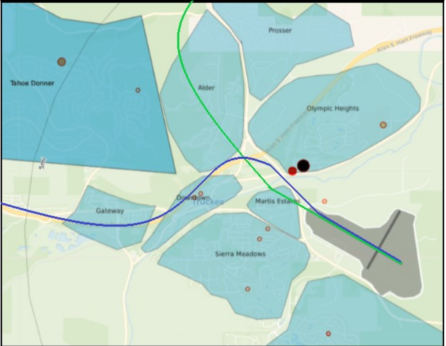
Exhibit 4: Noise Comment Heap Map (with approximate Truck Four departure and HWY 267 Bypass departure)