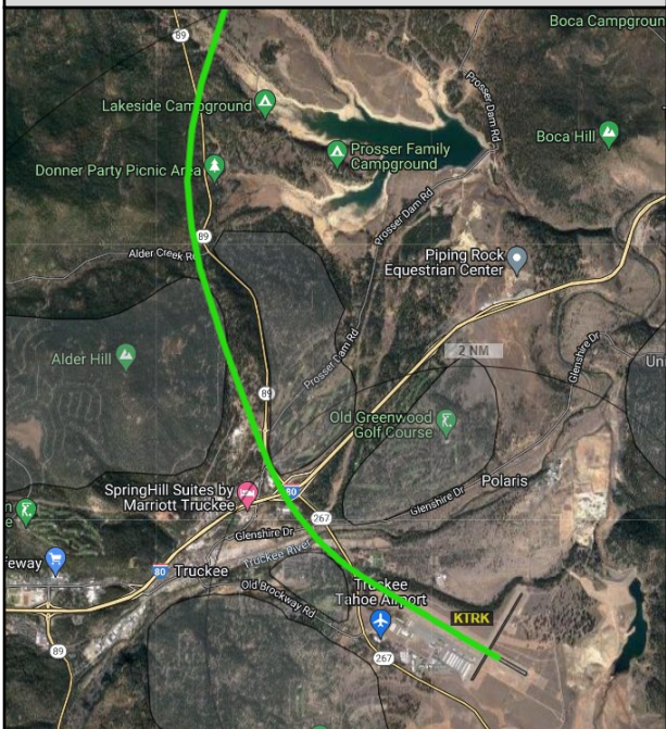
Exhibit 6b: MOWGL 1 Departure (Challenger 350)