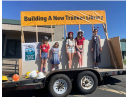
Friends of the Truckee Library Fourth of July Parade Float

To review report submissions, please follow this link.