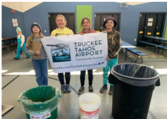
Sierra Watershed Education Partnerships