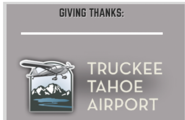
North Tahoe Fire Protection District