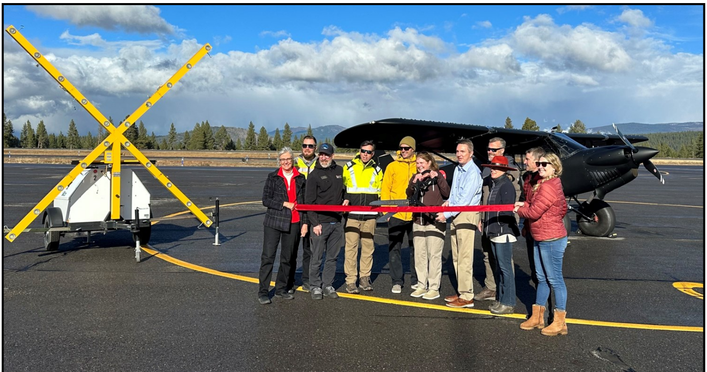
Runway 2/20 re-opening ribbon cutting ceremony

TTAD Website Stats 4.7K users, 14,813 page views