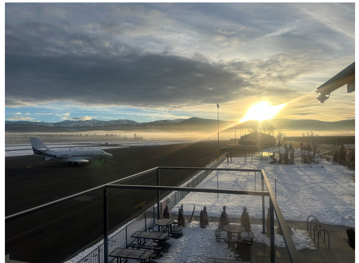
Winter sunrise at KTRK