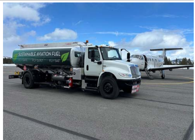
SAF Jet-A Fuel truck with new Sustainable Aviation Fuel wrap.