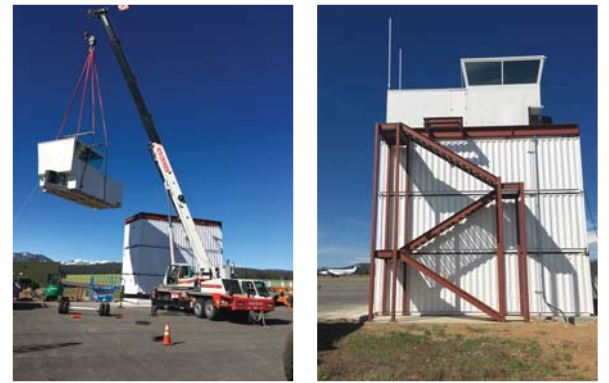
▲ Views of the Tower during construction that took place this past spring.

A temporary seasonal air traffic control tower is coming to the Truckee Tahoe Airport airfield this June to help improve safety, efficiency, and reduce community noise and annoyance.