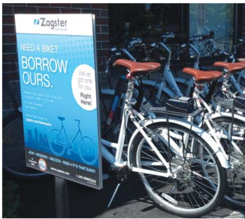
▲ Bikes will be available at the Airport and Downtown Truckee.

Once a user has downloaded the app and set up a Zagster account, they will be able to enjoy the bike share program anywhere in the world where there are stations. To learn more, go to truckeetahoeairport.com . Or visit zagster.com to learn about the service and app.