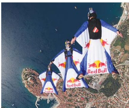
▲ Catch the Red Bull Air Force Wingsuit Team in action.

A special thanks to our major sponsors to date – Western Aircraft, Pilatus, Piper, Clear Capital, and Suddenlink. For more information, visit TruckeeTahoeAirshow.com .