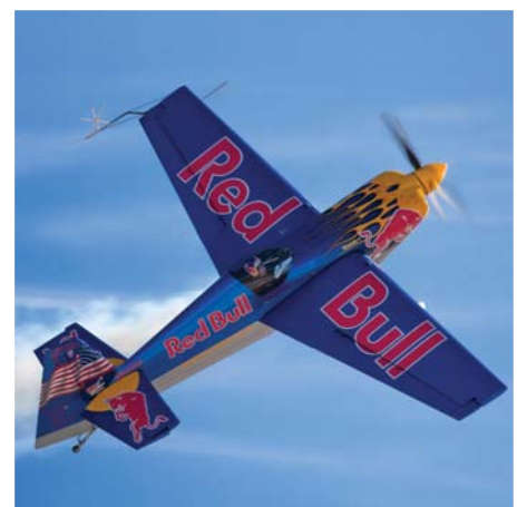
▲ This year's show will feature world-renowned aerobatics.