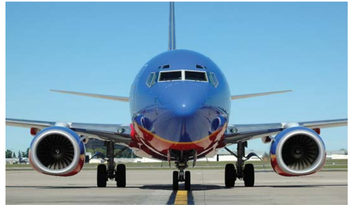
▲ RASC works with airlines to get better routes and rates to and from the Reno-Tahoe region.

Beyond creating an aviation benefit for all residents of the District, more convenient direct flights may mean less flights – and less noise and annoyance – if a passenger chooses to fly out of