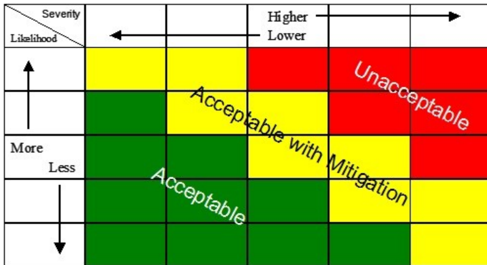
Figure A-2. Safety Risk Matrix Examples